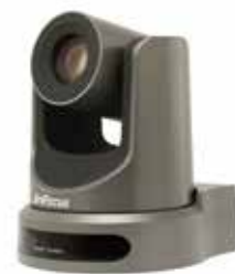
RealCam PTZ Camera

Thunder Speakerphone (INA-TH150): VoiceAware anti-echo & noise-reducing technology for any size meeting room