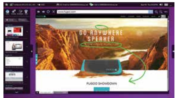
Web Browsing with Annotation